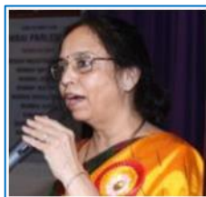
Rtn. Revati Kanvinde Youth Service