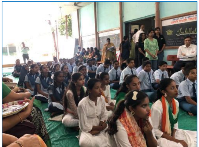
Interactors listening to the Speakers attentively

We meet alternate Saturday at 9.00 a.m. at AOTS Hall else on Zoom Conference.