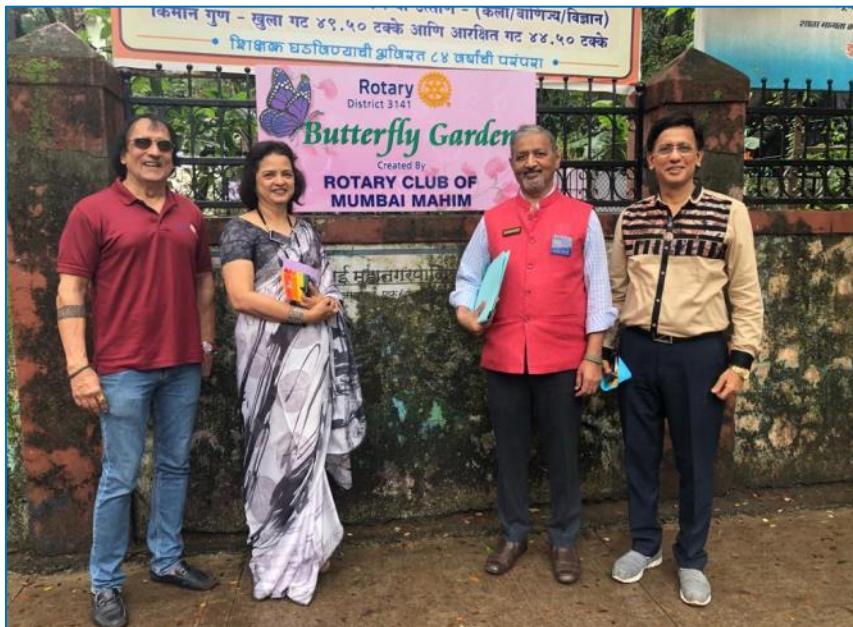
Butterfly Garden View from Road Side

We meet alternate Saturday at 9.00 a.m. at AOTS Hall else on Zoom Conference.