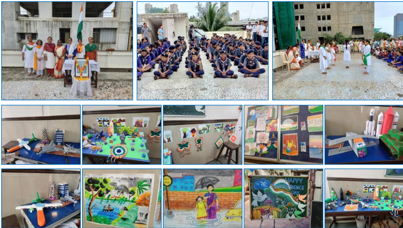
Rtns. Jayanti and Nita celebrated Independence Day at Premier School. Students had displayed their beautiful drawings.