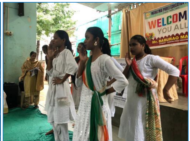
Excellent Dance Performance by the Students