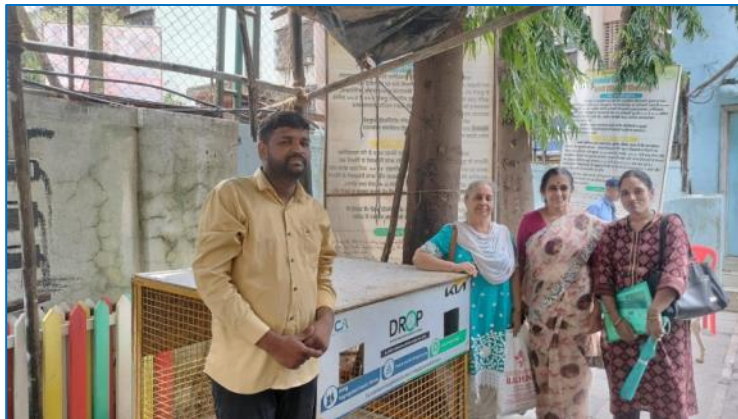
DROP Box for dropping plastic and recyclable items