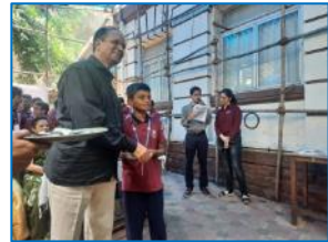
Awarding Lapel Pins to Board of Directors