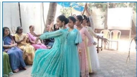
Welcome Dance Performance by Students

We meet alternate Saturday at 9.00 a.m. at AOTS Hall else on Zoom Conference.