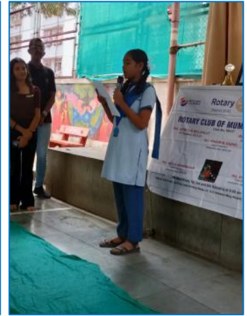
Installation of Interact President and Acceptance speech by her